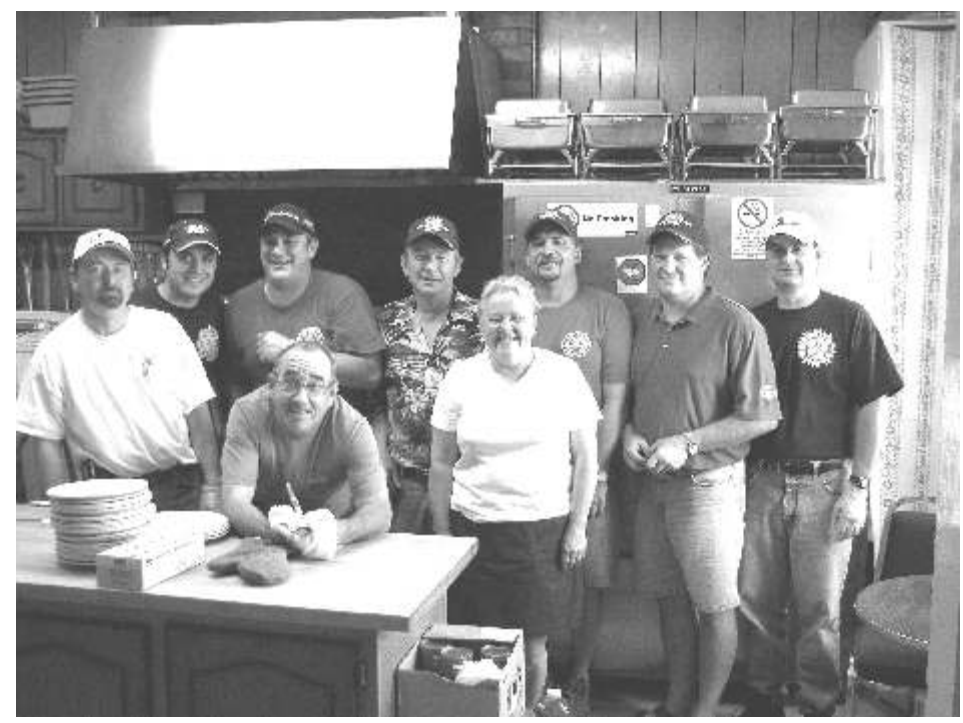
Some of the enthusiastic Chapleau Firefighters Association Members take a quick photo break before returning to busy kitchen duties.

he Chapleau Firefighters Association spaghetti dinners are a favourite with local residents and are always well attended. Friday's fundraiser was no exception. Hungry supporters began to arrive even before the advertised time but, calling on past experiences, the Association volunteers were readv for them. Individuals, couples, groups and whole families attended to show support for this