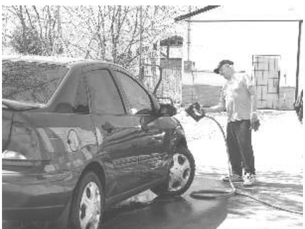
A sure sign of spring is a clean shiny vehicle. Getting out in the warm weather to wash your car always feels good.

The air quality inside the home can also be improved by opening up windows to let fresh air in. Rugs, cushions, and other items that can't be