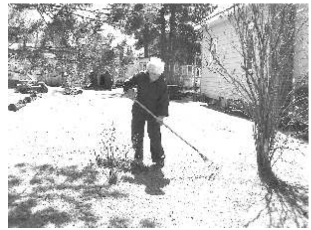
Further down Main Street a resident gets a head start on a healthy lawn by raking up dead grass and debris