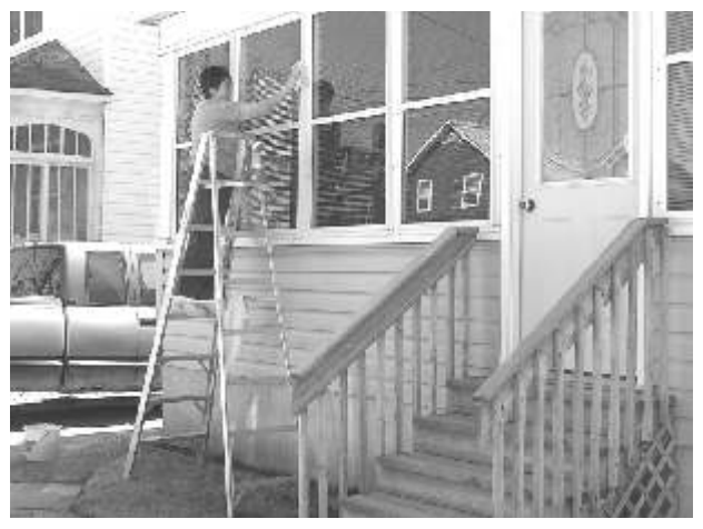
A homeowner in the downtown area takes advantage of the sunshine to begin cleaning outside windows.

Similarly, when the nice weather encourages you to