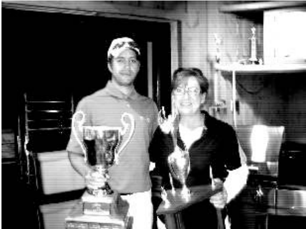
For the second year in a row a mother and son club champions.