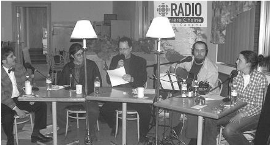
A crew from CBON, the French CBC radio station from Sudbury, was in Chapleau on Friday, April 23rd at Aux Trois Moulins for the recording of a special broadcast. Entitled "Le salut de l'arrière-pays", the series showcases Northern Ontario towns and villages. After Gogama and Verner, Chapleau was next to welcome the radio crew. The Chapleau feature will air on CBON at 10:00 a.m., May 15th.