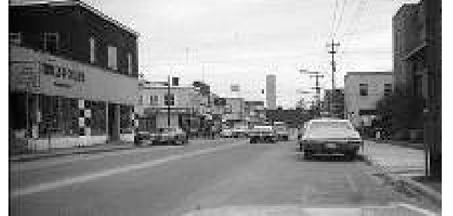
Downtown Chapleau

to the campaign for members by the concert association far exceeded expectations and Feux Follets presented for the grand opening of professional performances in Chapleau saw no empty seats in the house.