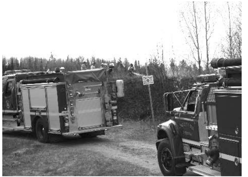
The Chapleau Fire Department was called in to put out a railway track blaze near the sewage pumping station on Martel road. Fire danger continues to be high due to dry conditions.