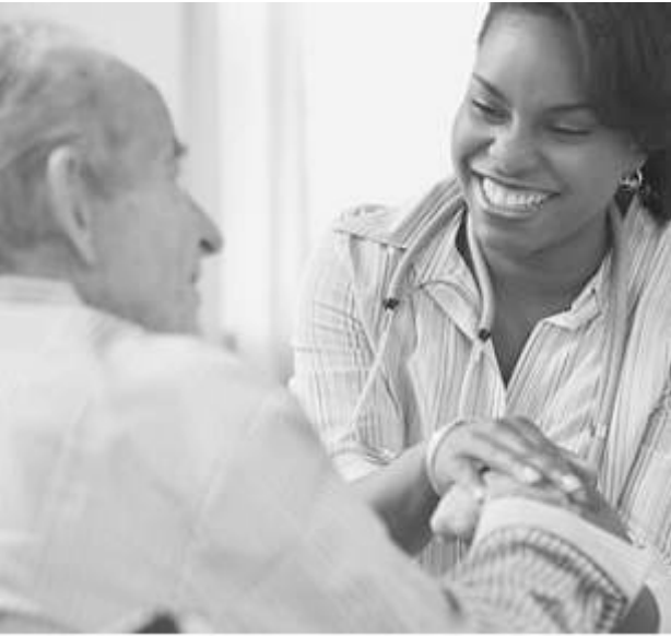
/CNW Safety, established to address incidents of abuse and neglect in Long-Term Care Task Force on Resident Care and long-term care homes as

well as the potential underreporting of these incidents, has finalized its action plan for the long-term care sector.