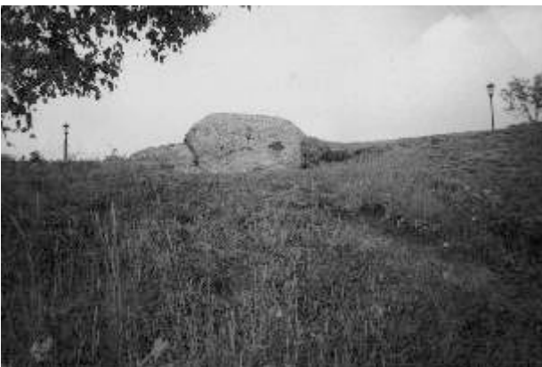
The Big Rock on the 'Back River'