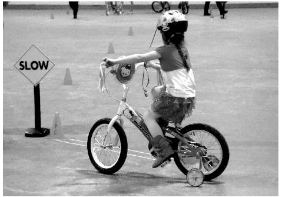
Young participant testing her skills in the bike rodeo.

Chapleau Child Care Centre organized the event with the support of the Chapleau Children's Service Provider Network. They want all families in Chapleau to be aware of the services in their community, as they want families to