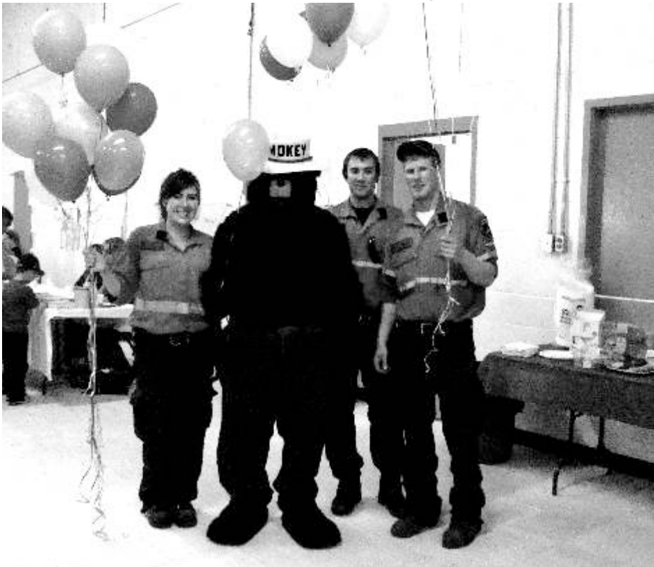
Smokey the Bear and representatives from the Ministry of Natural Resources Fire Management team.

On Friday, June 8th children's service providers and community partners came together at the Moore arena to offer an Open House/Safe Kids Day event. Children's service providers gathered in the community hall