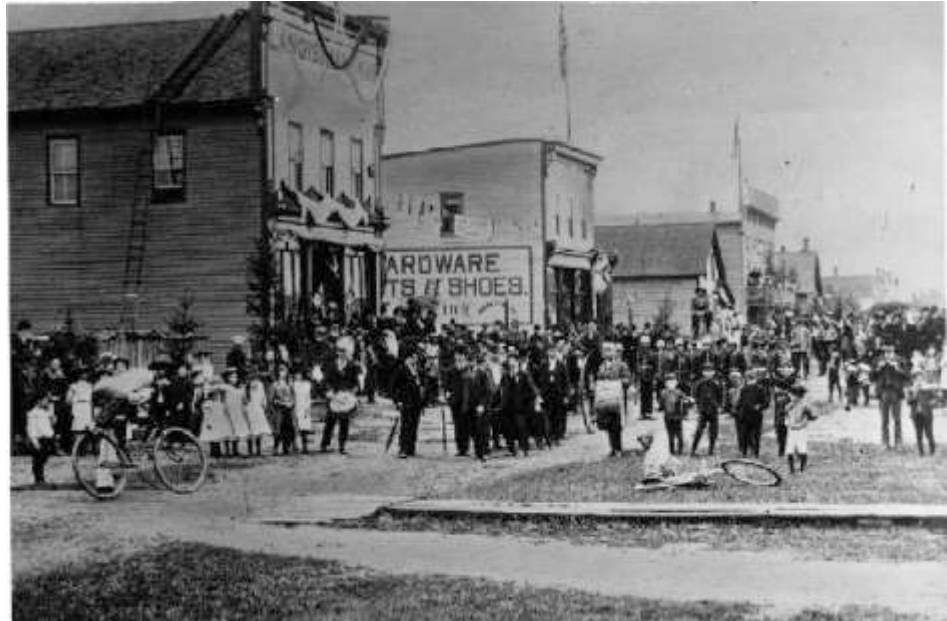
Dominion Day (Canada Day) Chapleau 1903