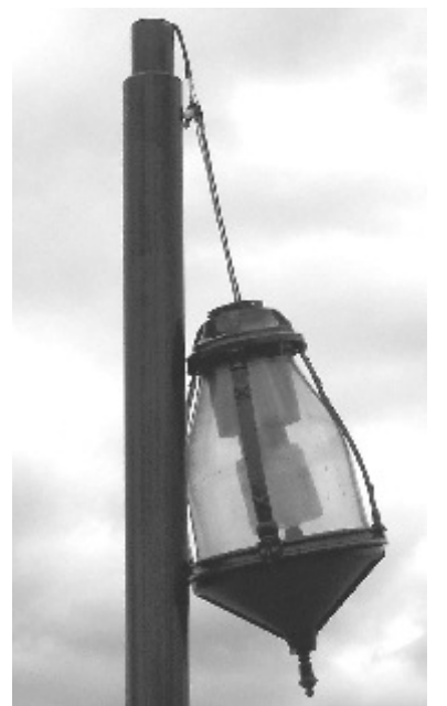
Pictured here, the vandalized light fixture at the Waterfront

The township is fighting back though. Council has accepted an offer from the Chapleau Rotary Club to install a security camera at the waterfront pavilion. Plans are also in the works to put in security cameras around town hall. The Chapleau O.P.P. Detachment is joining the fight as well. It is changing to its summer hours to help combat the mischief at the waterfront and throughout town. The evening shift will now work from 8 p.m. until 6 a.m.