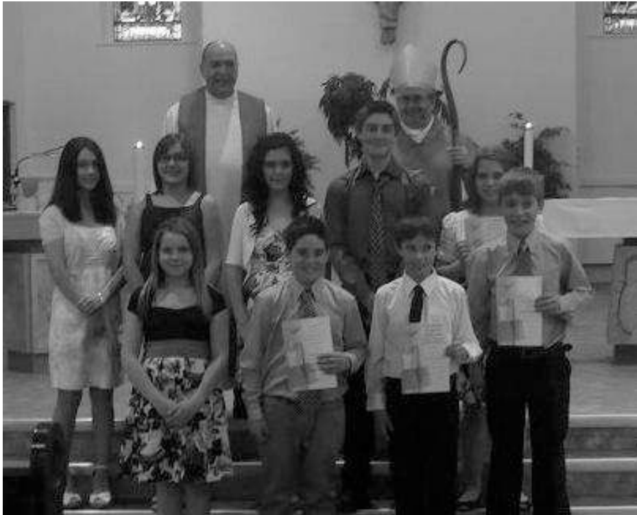
Les élèves de 7e de l'École secondaire catholique Trillium ont reçu le sacrement de la confirmation à l'église Sacré-Coeur le 2 juin dernier.