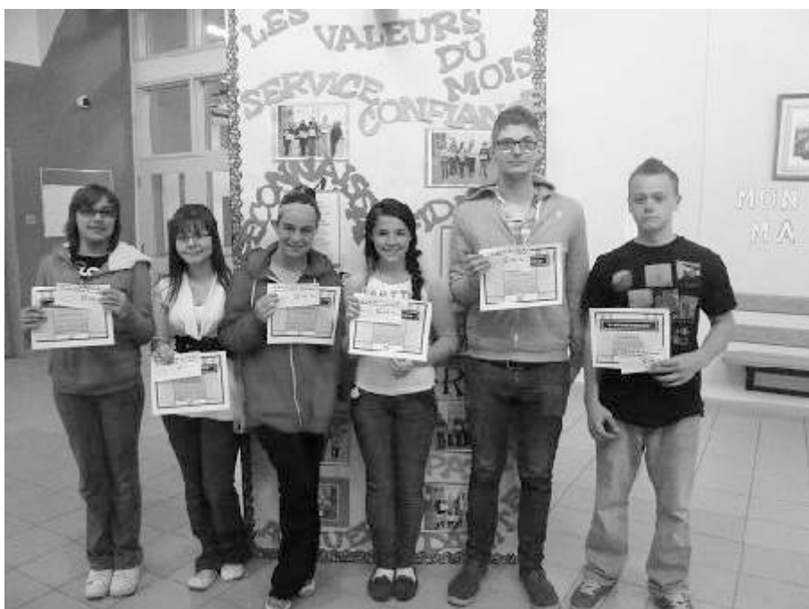
Les élèves de l'École secondaire catholique Trillium se méritant la valeur de la reconnaissance pour le mois de mai sont:

D'après les commentaires, tous les élèves aiment ce qu'ils voient et