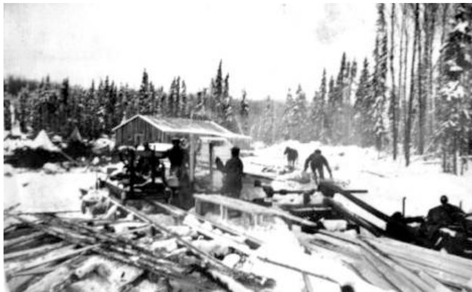
Shown above is the first sawmill in Racine Lake in November 1949