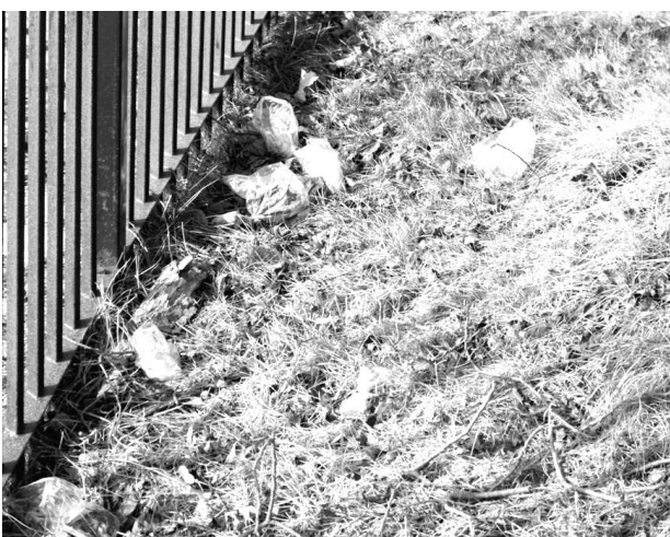
Plastic bags with excrements shown above.

Protestant cemetery on Birch St. Please feel free to report these individuals to the proper authorities.