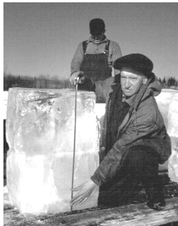
Block of ice being measured on the Chapleau River. The men in photo not identified.

doors were shut and sealed. Ice is brittle and even with care and not much care was exhib-