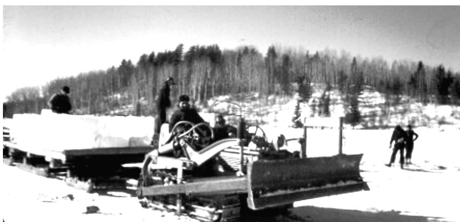
Tractor pulling sleigh with blocks of ice from Chapleau River that will be used on CPR passenger trains in summer months.