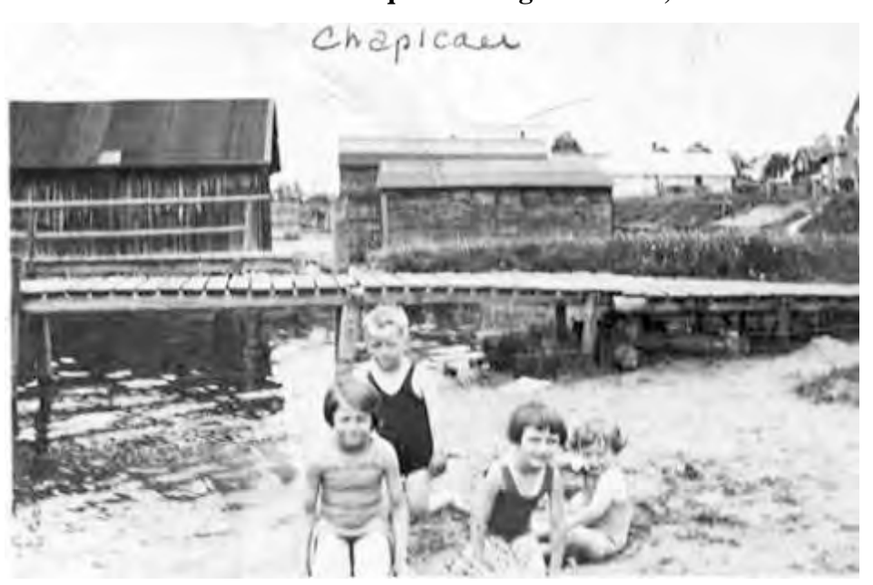
The Pig Pen swimming hole, 1930s