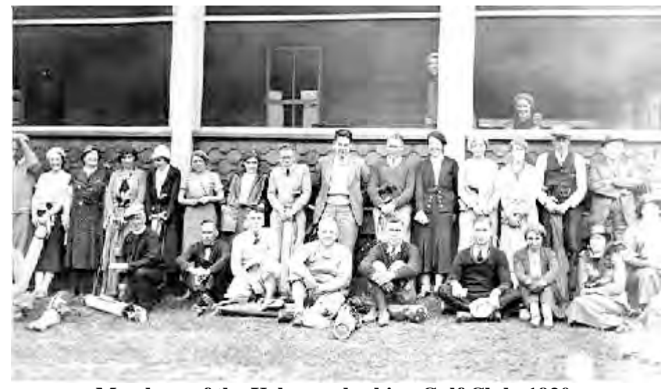
Members of the Kebsquasheshing Golf Club, 1920s

Imagine all the stories that must have centred around the Pig Pen, and yes, the boathouses too, that dominated Chapleau's waterfront.