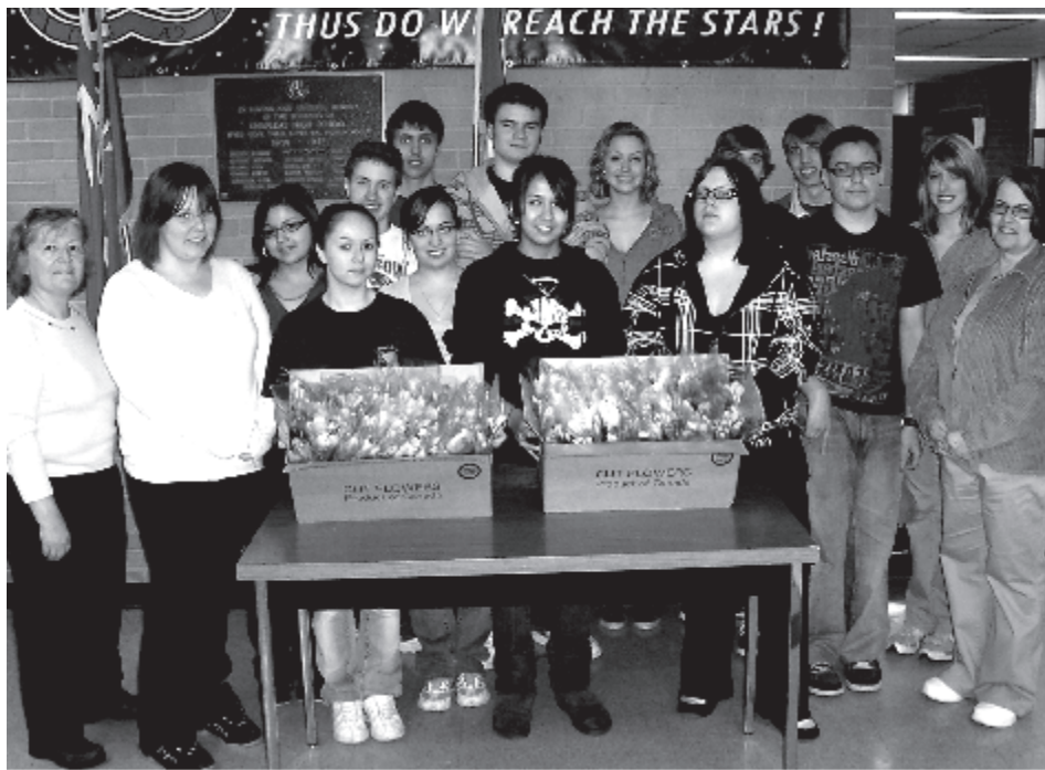
Sur la photo, un groupe de bénévoles du conseil étudiant de l'école Chapleau High School, qui se sont associés à la branche locale de la Société Canadienne du Cancer pendant la campagne de jonquilles la semaine dernière. Les étudiants ont vendu les jonquilles à l'avance à leurs camarades de classe, leurs familles et amis. Leurs efforts ont connu un succès énorme, avec comme résultat d'avoir vendu presque 20% de toutes les jonquilles achetées dans la communauté. Une réussite merveilleuse à souligner!

contribué à établir un nouveau record de vente pour Chapleau cette année. Nos excuses à tous ceux qui n'ont pas pu se procurer des jonquilles cette année. L'équipe locale tentera d'obtenir plus de fleurs pour la campagne de l'année prochaine.