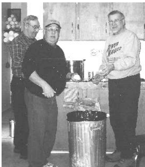
The men in the kitchen are getting potatoes ready for those delicious poutines and fries.