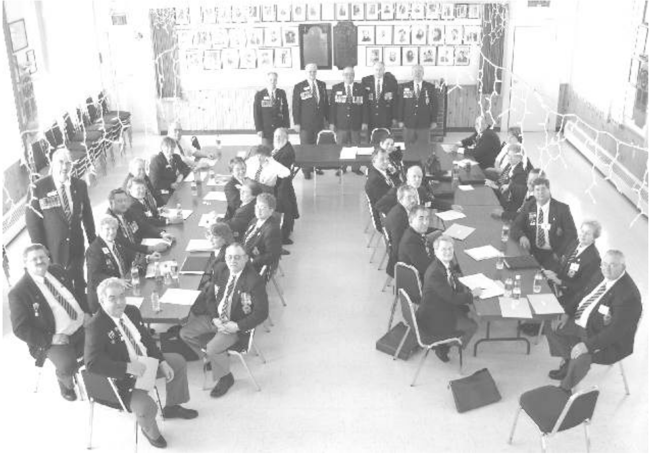
The 37 Presidents of the District H Legion branches took advantage of their time together during their convention in Chapleau to discuss policies, and the many matters and activities that took place during the course of the past year. The group, along with the Ontario Command Officers, paused for a group photo before getting back to the business at hand.

Un test de dépistage du cancer ne prend que quelques minutes mais pourrait ajouter des années à votre vie!