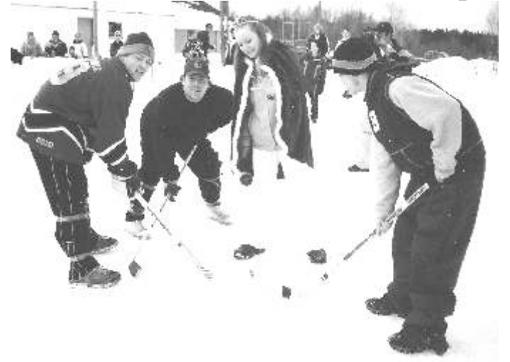
Looks like the boys are anxious to get the game rolling and win the face off.